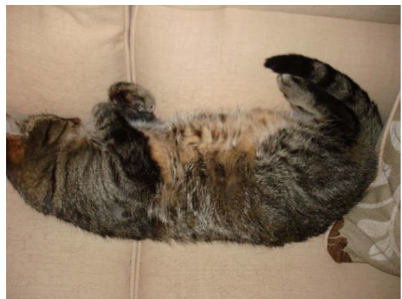
Photos: Tigger the Terrible