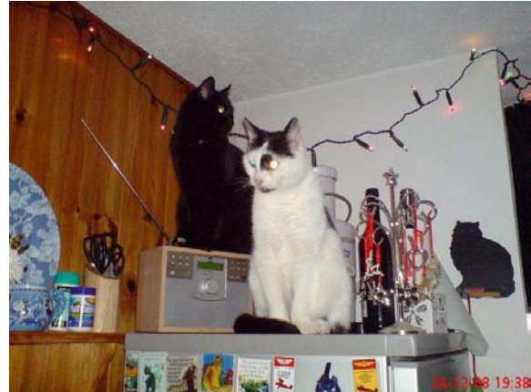
Photo: me and Rocky

My boyfriend Rocky has taught me a new trick. He likes to sit on top of the fridge freezer sometimes but he found that the radio was a good place to sit out of the way as well. So I've copied him, as you can see from the picture below: