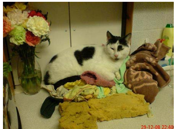
Photo: Rocky on the rags

Daddy washed the car today and didn't put the rags away afterwards so Mummy took a photo of him: