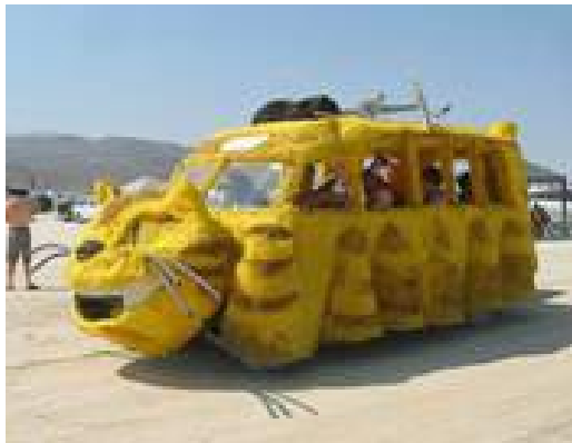
Sam Collington Oct 2009

I may or may not have shown this one before but my dry-witted husband suggested that this might be the new CLAWS vehicle – or as he put it “CLAWS volunteers go on tour”. Let’s grab a couple of guitars and head out on the road – I’m sure we can think of some songs to singalong to!