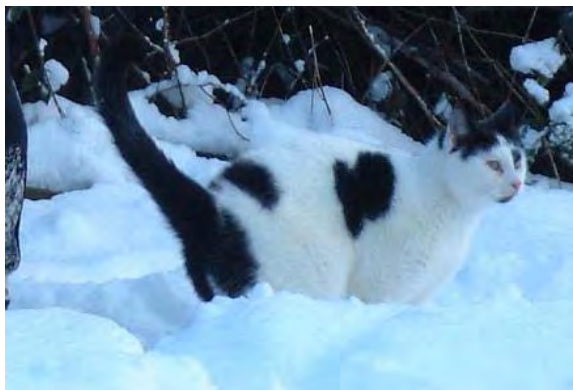
Photo: Rocky in the January snows