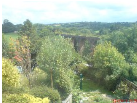
Photo: view from our upstairs windows

"Am not bovvered really...is it time to eat yet?"