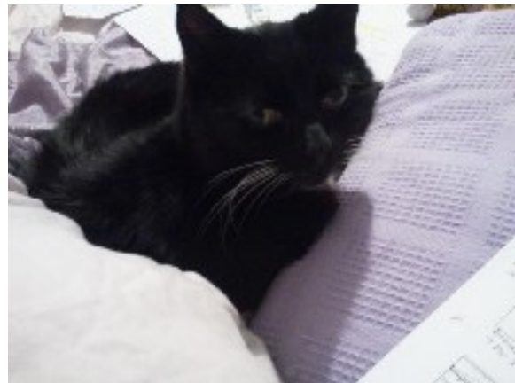
Photo: Tilly snuggling up